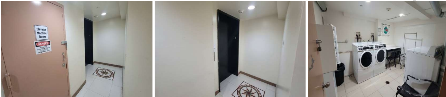
LOWER LEVEL Laundry-room