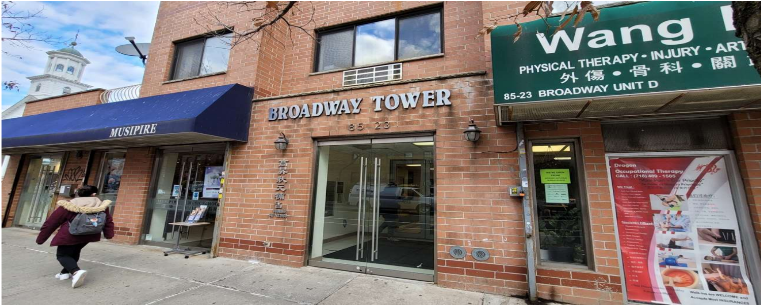
SECURE BUILDING ENTRANCE WITH LOBBY AND CAMERA BUZZERS IN EACH UNIT